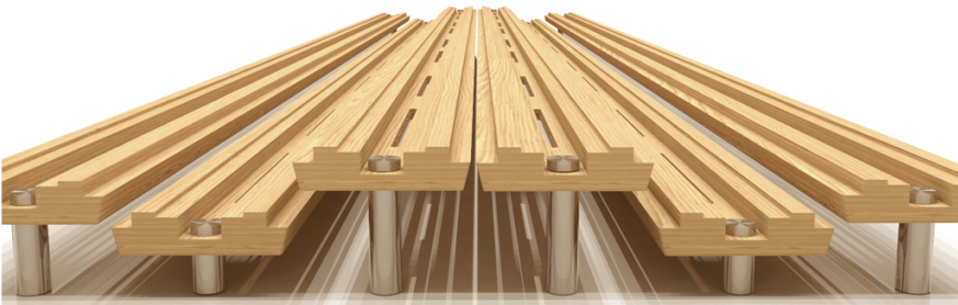
1 3/4", 1" and 2 1/2" standoffs; slotted