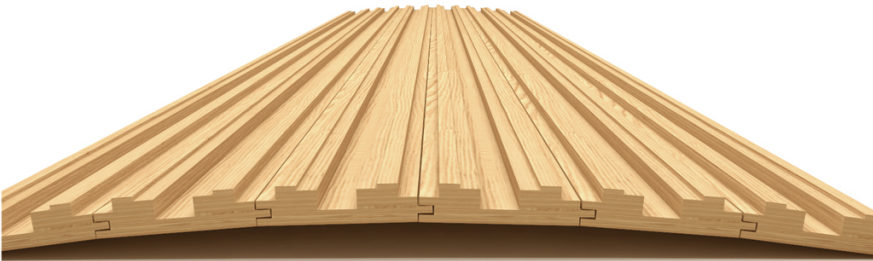
Convex curve with 77" radius; not slotted